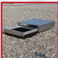
Slidewise™ Roof Hatch