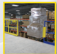
SafeMezz™ Horizontal Gate

701.746.4519 | 877.446.1519 | www.pssafetyaccess.com | 4psinfo@psindustries.com