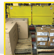
Pallet Rack Safety Gate