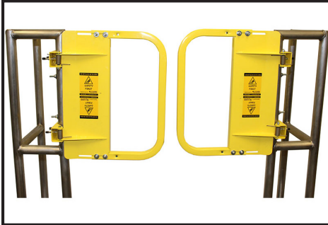
Powder Coat Yellow