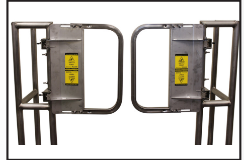
Stainless Steel (304)