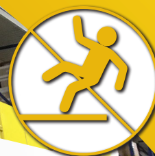
Personnel Fall Protection