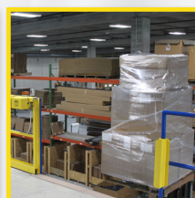
SafeMezz™ Horizontal Gate

OSHA-COMPLIANT The Pallet Gate meets OSHA standards 1910.28 and 1910.29.