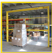
SafeMezz™ Vertical Gate