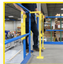
Stand-Off Mounting System