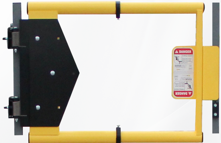
Product Number: ASG-1836-PCY

*Larger quantities and international orders may require longer lead times