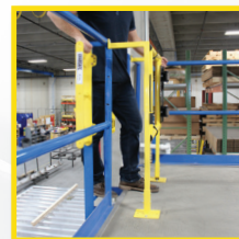
Stand-Off Mounting System