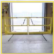
EdgeSafe® Smart Gate