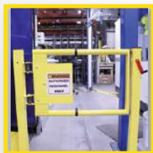
EdgeSafe® Personnel Access Gate