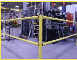
Ground-Level Area Protection